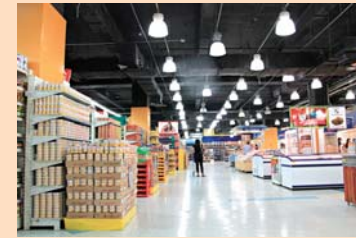
General merchandise store