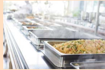
Meal replacement manufacturing